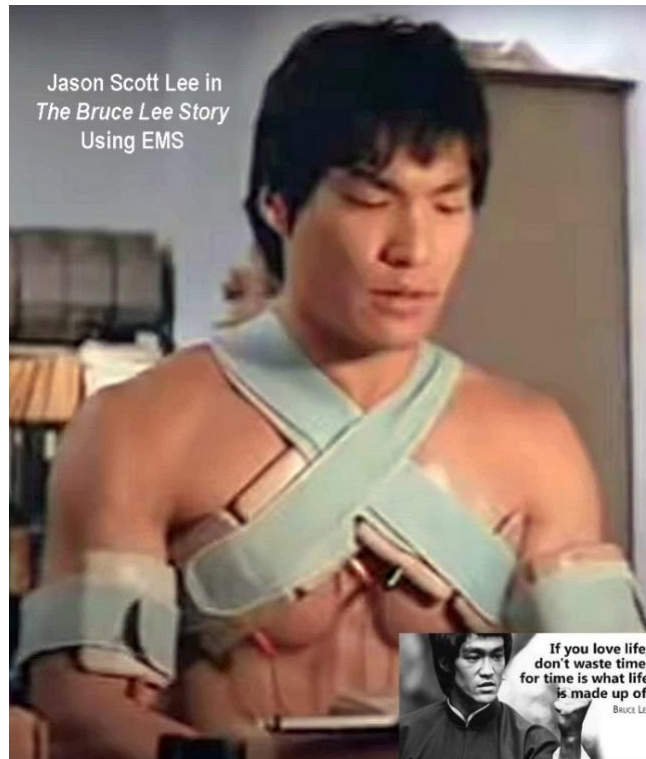
Bruce Lee was an innovator